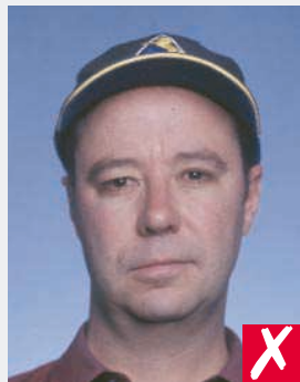
wearing a cap