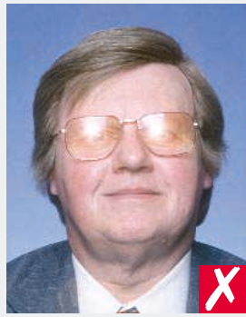
flash reflection on lenses