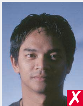
shadows across face