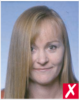
hair across eyes