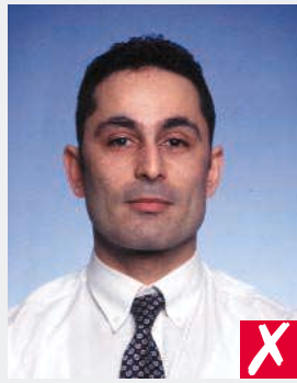
too far away