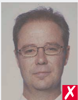
washed out colour