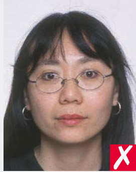
frames covering eyes