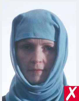
shadows across face