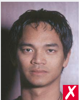
shadows behind head