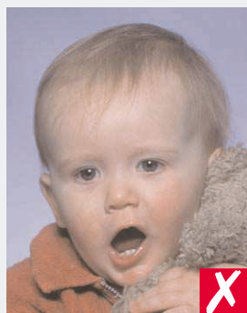
mouth open and toy too close to face