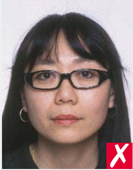
frames too heavy