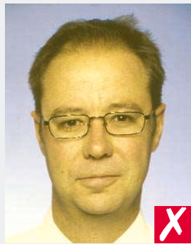
unnatural skin tones