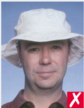
wearing a hat