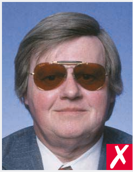
dark tinted lenses