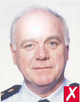
flash reflection on skin