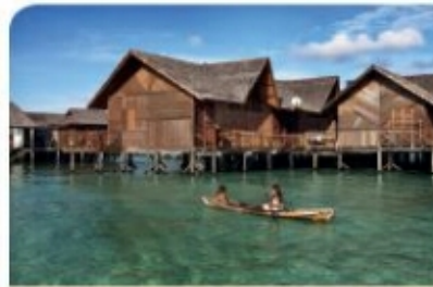
2 Stilt houses in Borneo

In some hot, wet places, people build houses on stilts. Stilt houses are built high above the water or land. The 'stilts' are tree trunks. The air blows under the houses and keeps them cool.