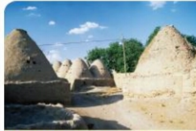
1 Beehive houses in Turkey

These houses are called beehive houses. Beehive houses are made of mud, water and dry grass. People build beehive houses in some hot, dry places. The mud walls and very small windows keep the homes cool.