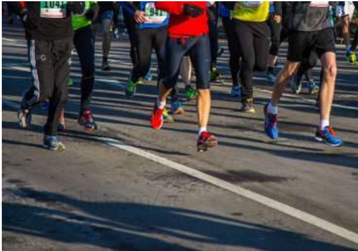
marathon