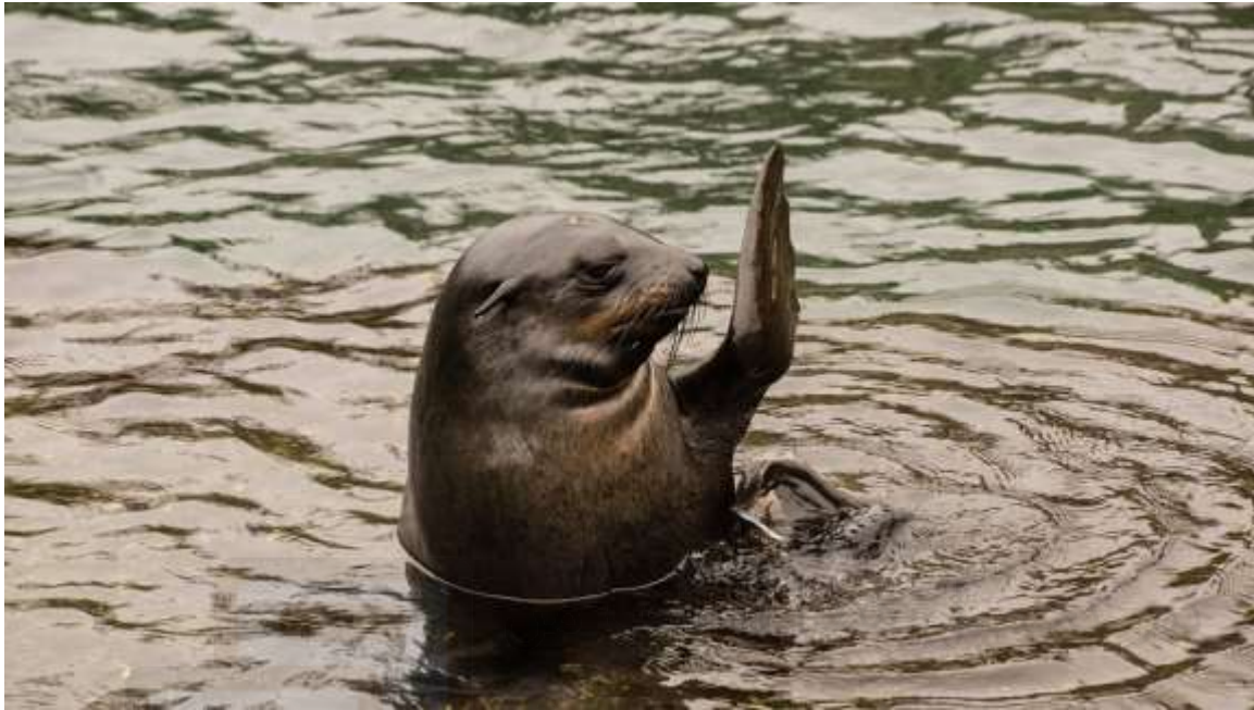
Hello , Taken 2016