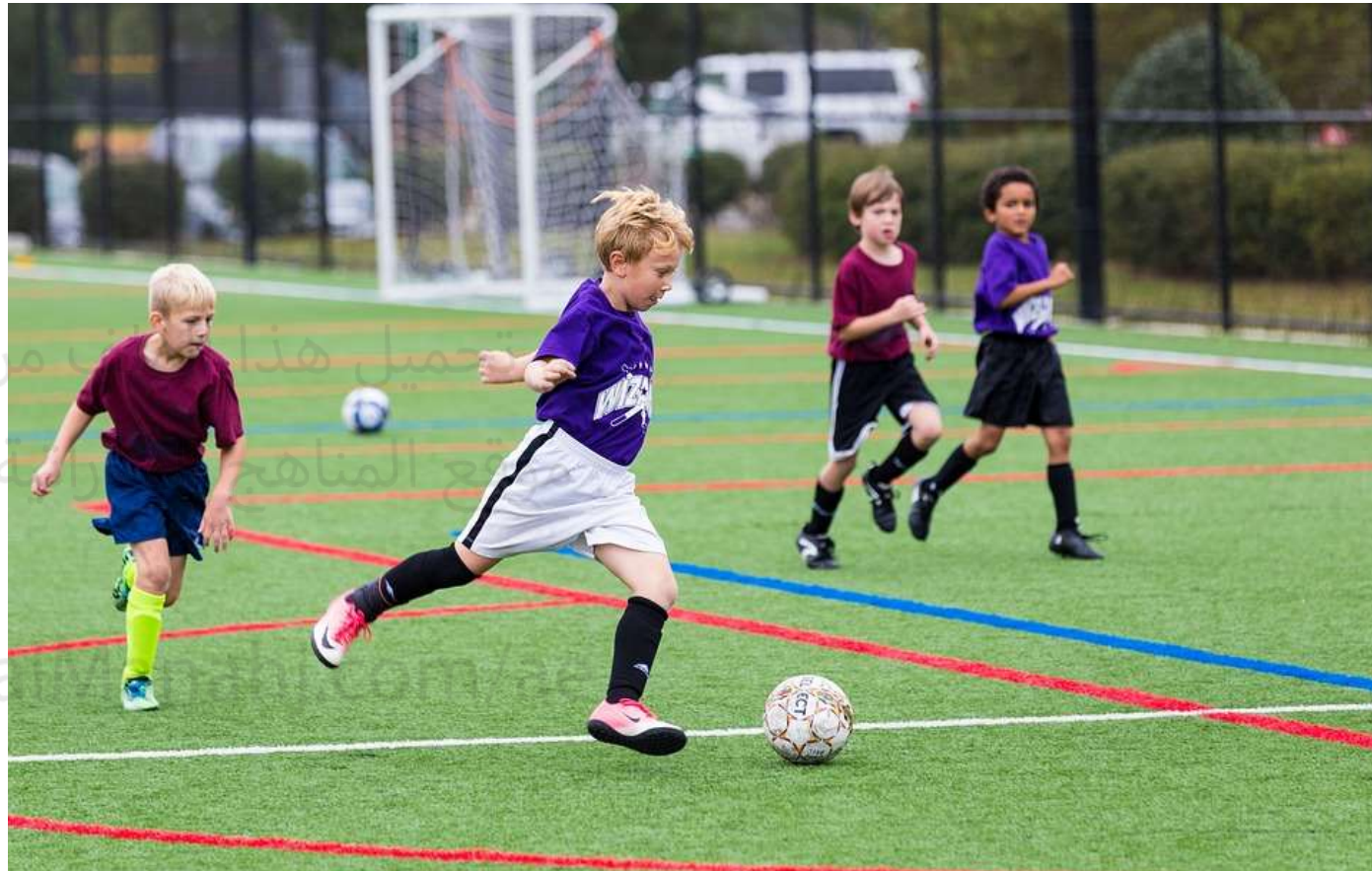
Soccer