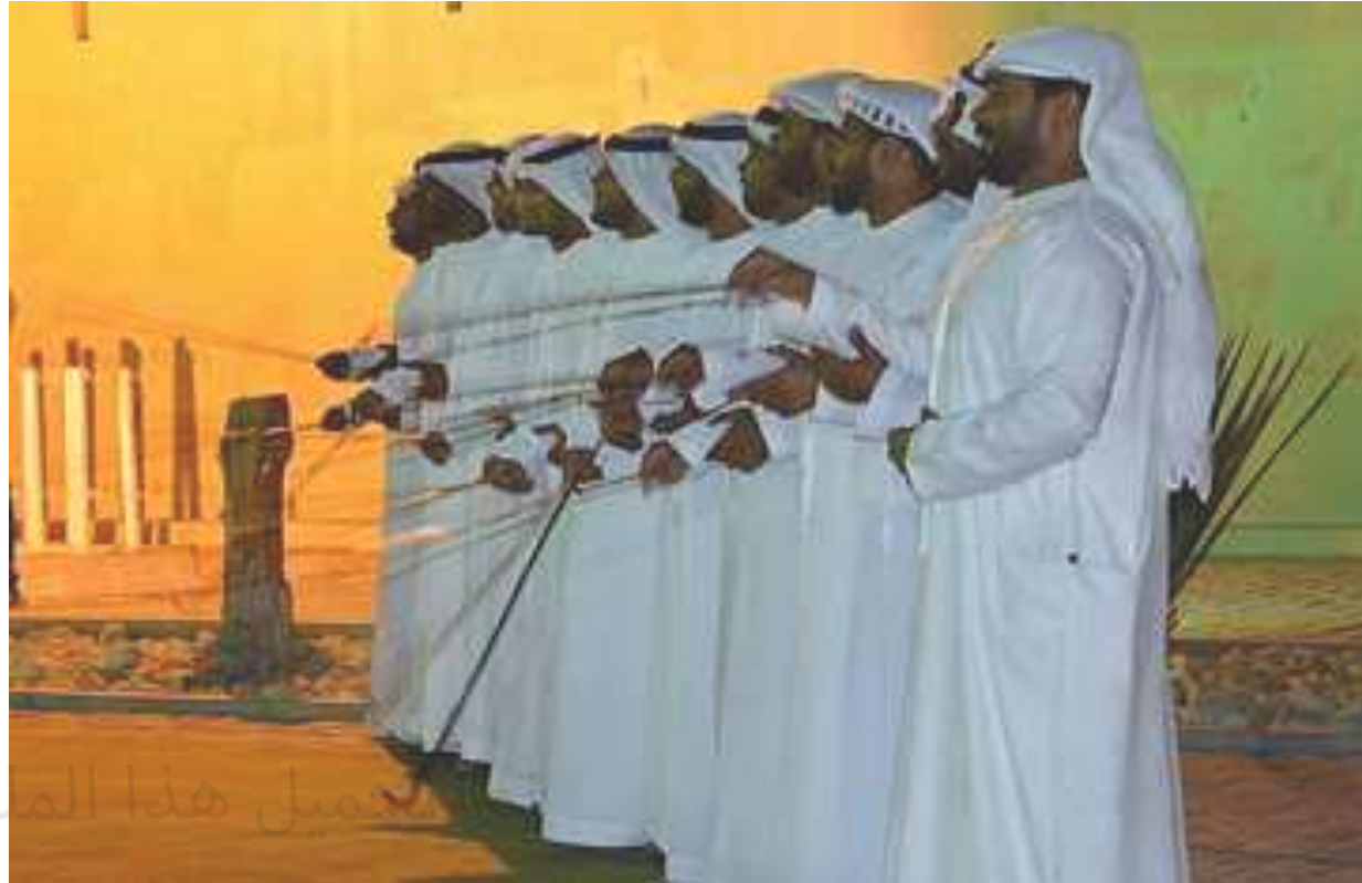
Al Ayala 'stick dance' by Rankin73, 2018, CC BY-SA

موقع السامح الإماراتية تحميل هذا الملف من