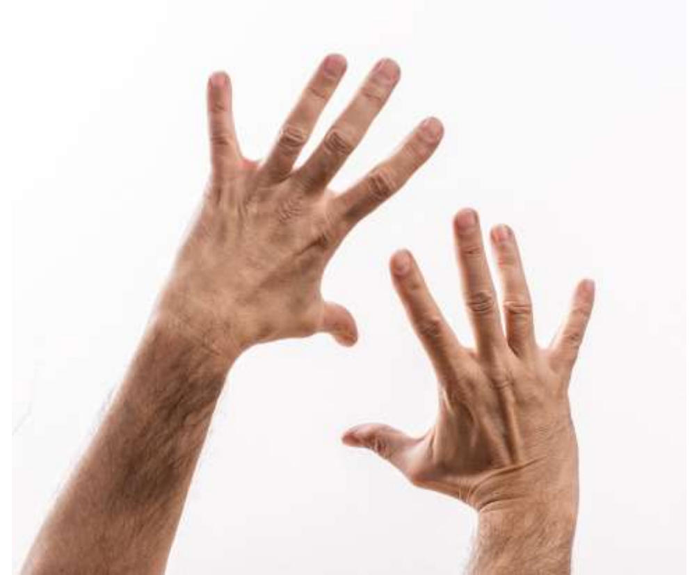
Hand wave